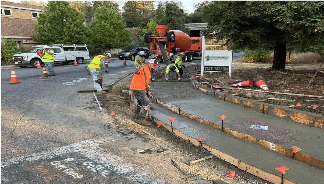
Pouring Sidewalk Ramp (top), Sewer Line Install on Broadway (bottom)